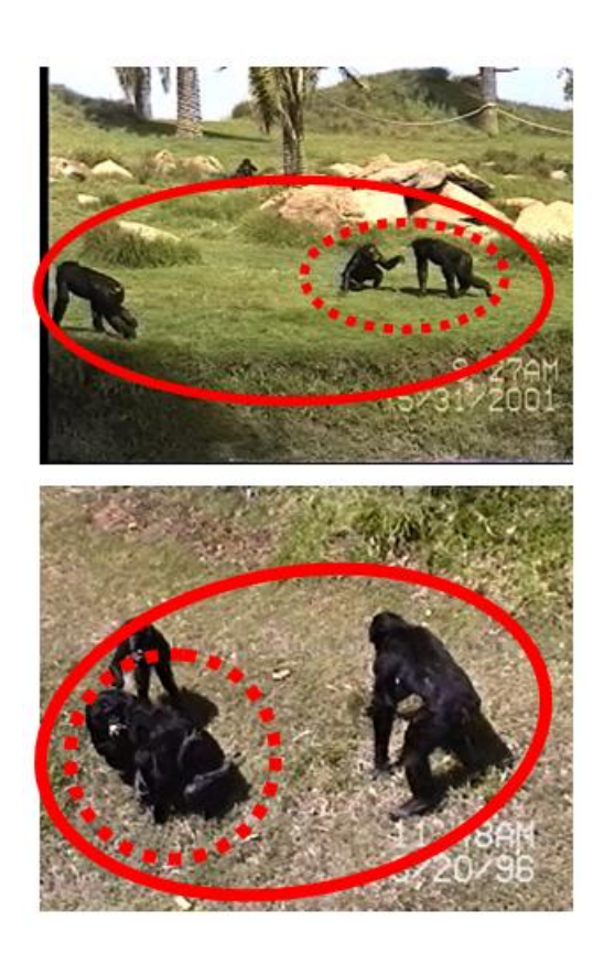
Figure 1. Social Tool use: User's interaction with Tool (dotted oval) is embedded in User's interaction with Target (solid oval), in "Recruit" (top frame) and "Buffer" (bottom frame).