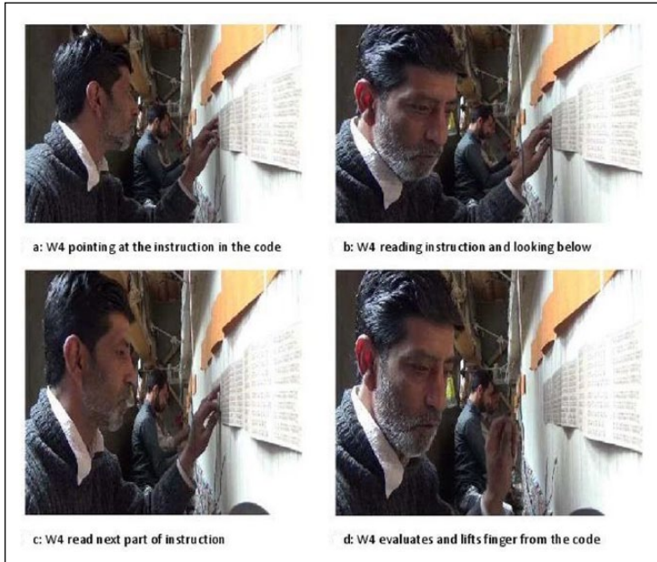
Figure 2. Evaluation being done by W4

(Goodwin & Goodwin, 1996) informed by the task relevancy in the local environment suffused with tools and equipment. In these warp threads, the main page of the talim is inserted first, followed by sequential insertion of its auxiliary parts . This arrangement establishes a linear order of processing on rolls and puts them in shared access of other weavers. On my primary observational loom in the karkhana , while the main page and a small portion of part-1 fixed in the corner is read aloud by weaver-1 (W1) which is listened and followed by weaver-4, its part-2 and 3 fixed in the middle is read aloud by weaver-2 (W2) sitting beside W1 and is followed by weaver-3 in the middle. The roll placement on the loom accords with the weavers' seating arrangement and distributes the cognitive task of information extraction among both reader-weavers, i.e., W1 and W2 equally.