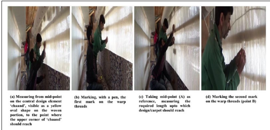
Figure 3. Measurement being done on the loom.

exhaustion of rolls in the set, but checks the progress of height on the loom. For instance, if one talim roll guides weaving activity of one-inch and there are 30 remaining rolls in the set, i.e., for guiding weaving of 30 inches or two-and-a-half feet, but the weavers' evaluation shows the required height of three feet till point B, then a discrepancy of half an inch, due to the thumping action, occurs. The remaining 30 rolls can only guide the weaving of two-and-a-half feet, but in order to complete the required 12 feet, three feet must be woven. This is the gap which the weavers now must fill.